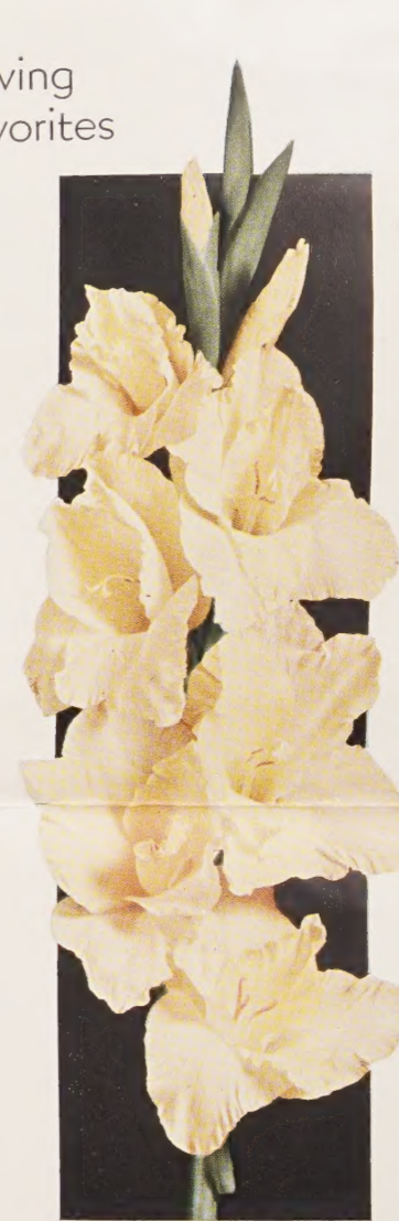
WASAGA $1.45 for 10 $12.00 per 100